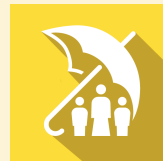
Support & Education for Families